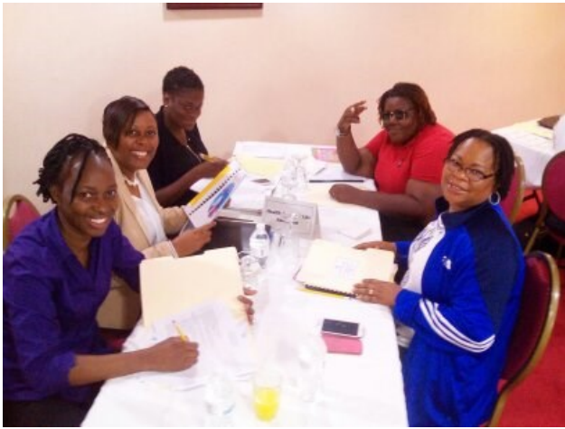
Health and Family Life Education Team

They reviewed the Scope and Sequence/ Attainment Targets and planned for the further development of the syllabus of the four subjects in the Early Childhood Curriculum.