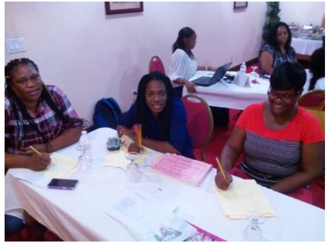
Religious and Moral Education Team