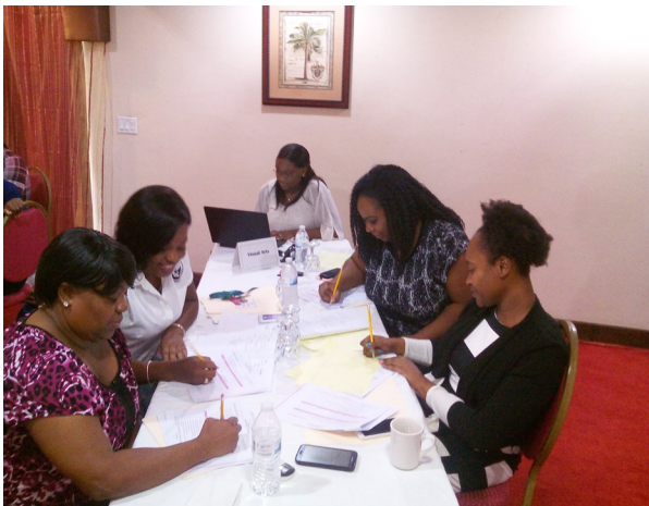
Visual Arts Team