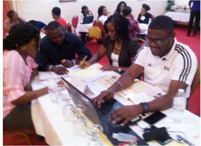
Physical Education Team