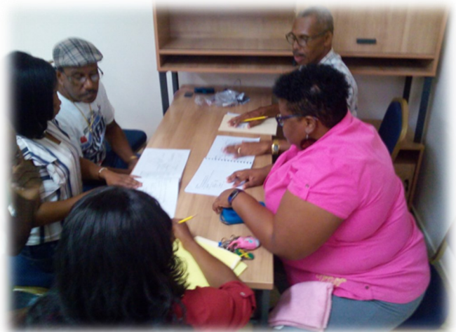
H.J. Robinson's teachers actively engage in the process

Three teachers from Marjorie Basden High School South Caicos also attended the CCSLC training in Grand Turk.