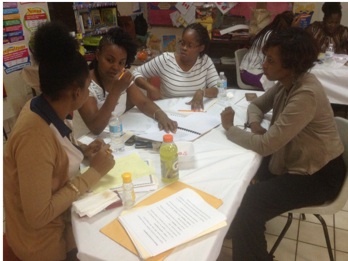
Teachers engaging in a group activity

Teachers were exposed to effective lesson planning and engaged in group work where they constructed curriculum webs, lesson plans and made presentations.