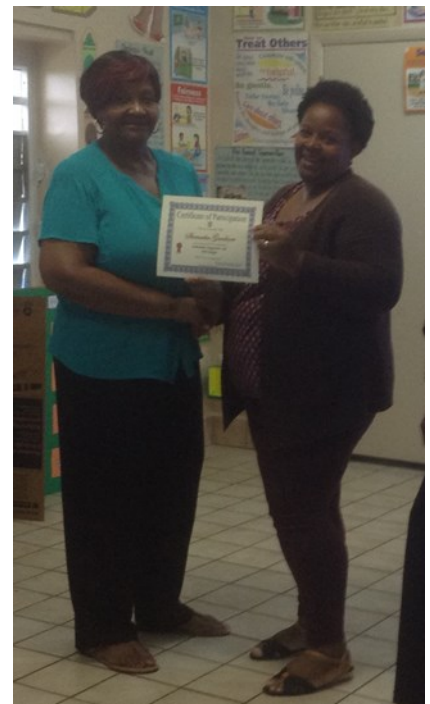
Teachers were presented with certificates of participation